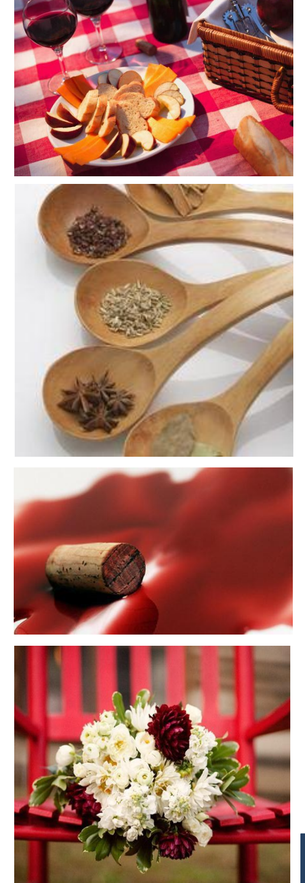
Please allow at least one week's notice to fullfill your adventures. We welcome last minute bookings based upon availability only.