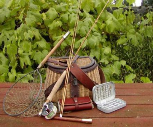
Please allow at least one week's notice to fulfill your adventures. We welcome last minute bookings based upon availability only.